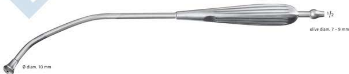
29-862 - (SMALL) 29-863 - (MEDIUM) 29-864 - (LARGE)