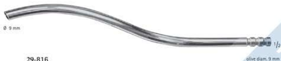
29-816 Universal cannula, double curved 230 mm