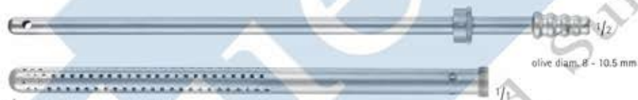
▲ Ø 10 mm Chart. 30