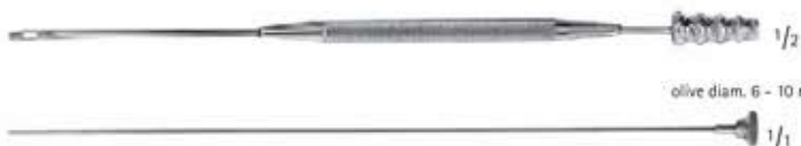
olive diam. 6 - 10 mm