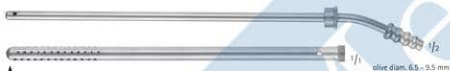
▲ Ø 7 mm Chart. 21