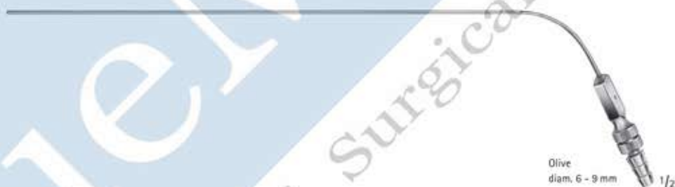
Olive diam. 6 - 9 mm