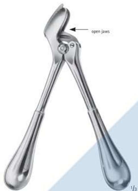
STILLE PLASTIC SHEAR