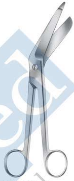
BERGMANN 28-553 230 mm