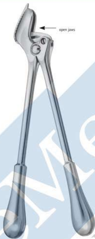
STILLE PLASTIC SHEAR