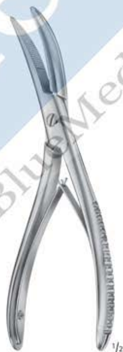
WOLFF 28-618 180 mm 28-624 240 mm