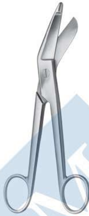
ESMARCH 28-550 200 mm 28-552 230 mm