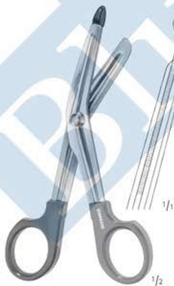
\frac{1}{2} LISTER 28-885 - 28-977