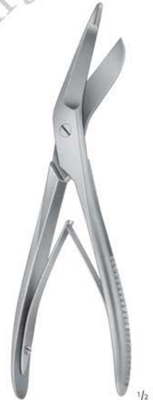
SEUTIN 28-565 230 mm