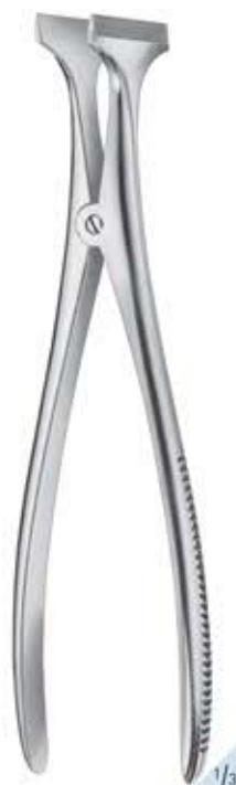
HENNIG 28-600 270 mm