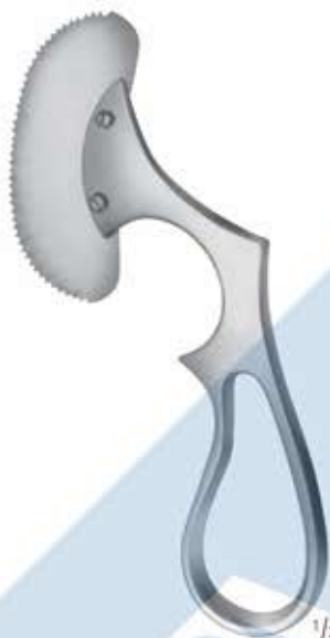
\frac{1}{2} ENGEL 28-522